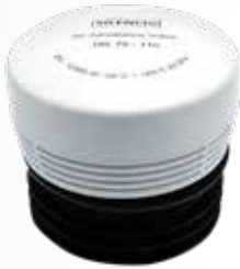
Air Admittance Valve Maxi (DN 75 - 110)