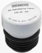
Air Admittance Valve Mini (DN 32 - 63)