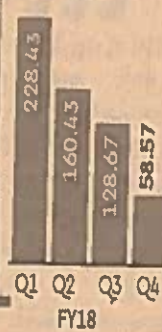
Sample of 1,578 companies (excluding banks, financials & OMCs)